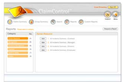
Powerful and flexible reporting

ClaimControl is designed for Finance Directors, Risk Managers or Insurance Managers who want to implement or expand on self-insurance programs; cut their uninsured losses; streamline claim management; or reduce their annual insurance premiums. Company Directors are also using it to help protect against corporate liability exposure.