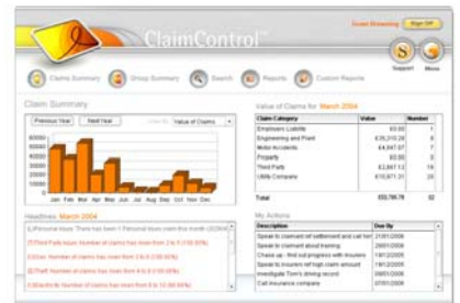
Instant Risk Position

Real-time management information reports mean that you can instantly identify risk issues within your business, take remedial actions, and eliminate costs. By providing detailed financial information about every incident within your company, ClaimControl arms you with the accurate and up-to-date figures you need when negotiating better insurance terms.